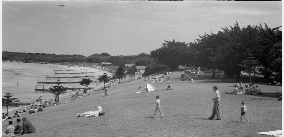
Exposed groynes Front Beach c. 1950s