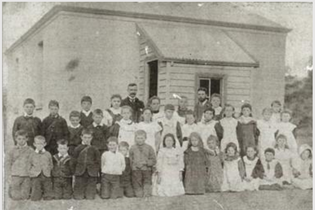
Jan Juc (Bellbrae) PS 1900.