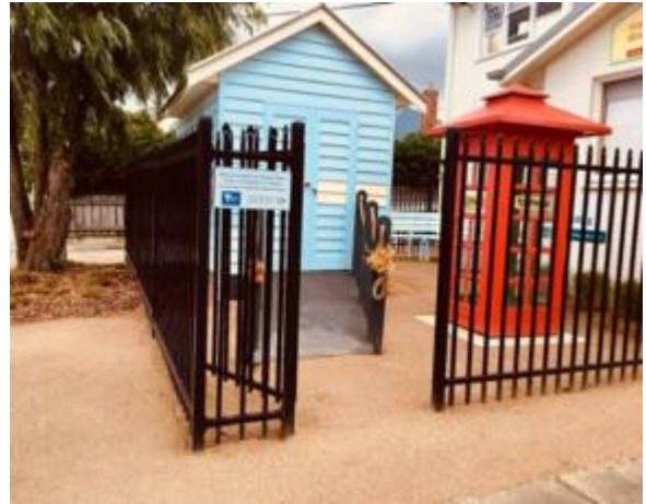
Recreated bathing box & restored telephone box in History House garden