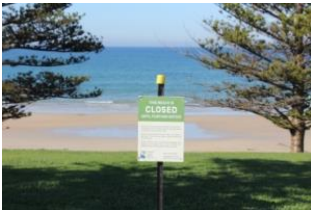
Beach closures due to COVID-19