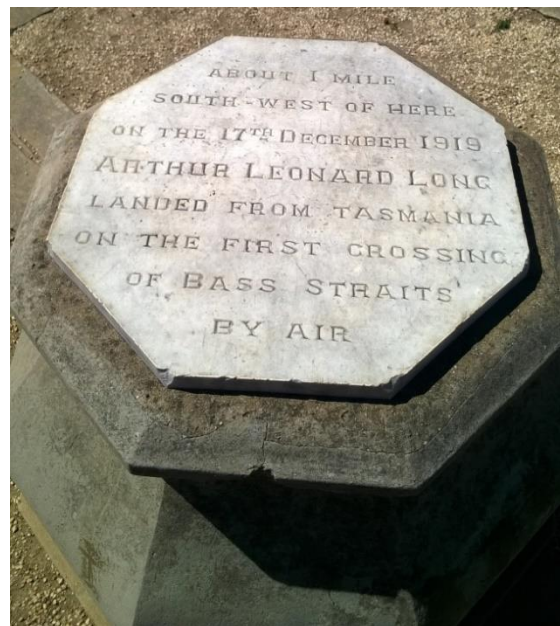
Arthur Leonard Long Memorial Front Beach