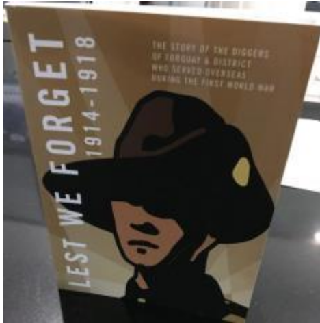
Story of the Diggers of Torquay & District