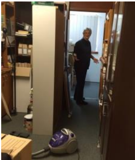
Cleaning and sorting at TOPS Lyn Ward