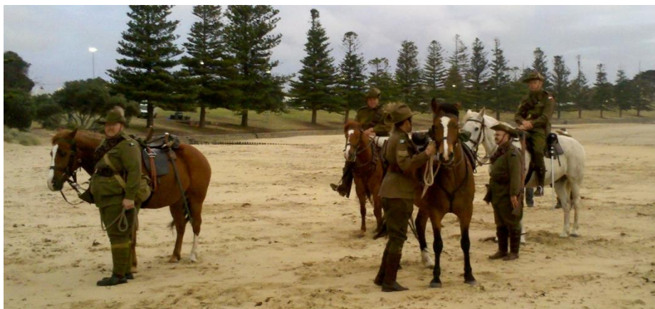
Light Horse re-enactment at Front Beach