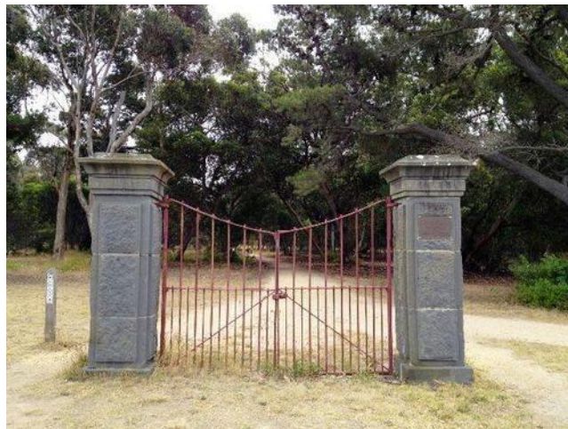
Taylor Park gates