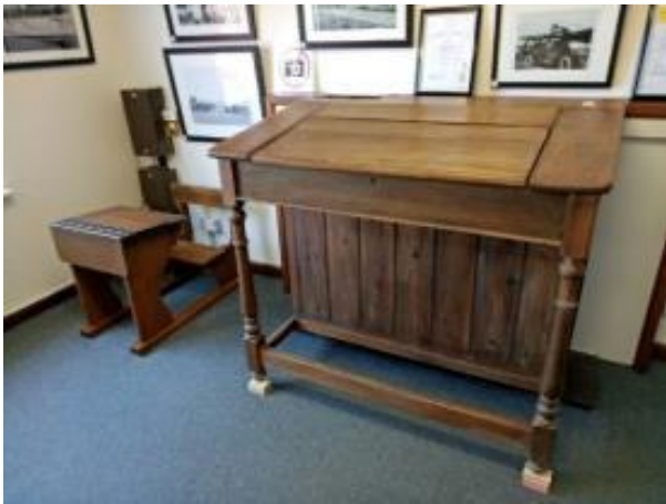
Headmasters desk restored beside small child's desk