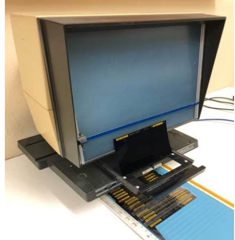
Microfiche and reader