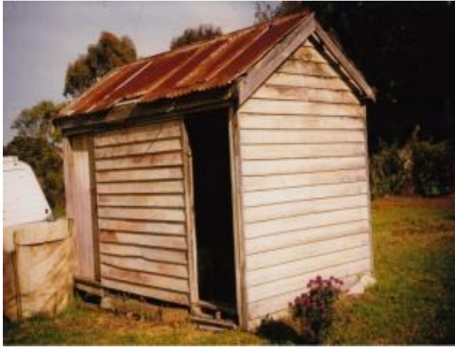
Dukes old bathing box Anderson Street